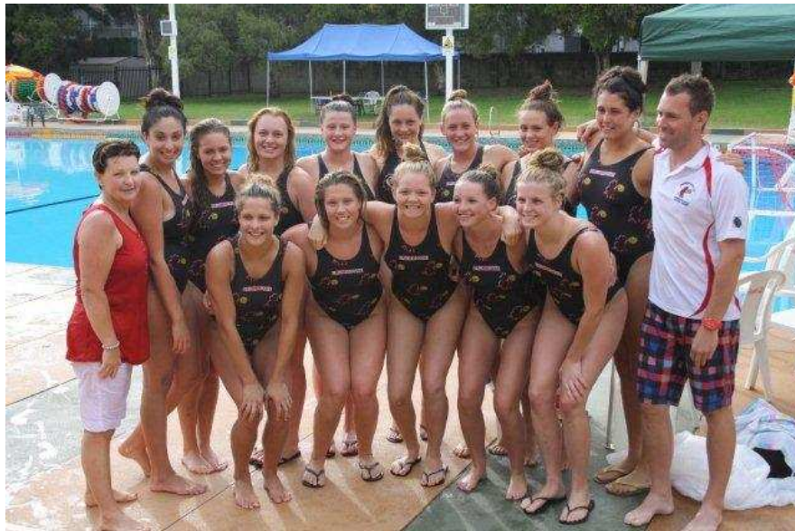
DRUMMOYNE U20 COL SMEE 2011 BACK TO BACK TO BACK WINNERS

Our opponent was Balmain after a rain, storm delayed other semi final and the final was nearly postponed to a mid week game but the decision was made and the game was eventually played and what a nail biter it was.