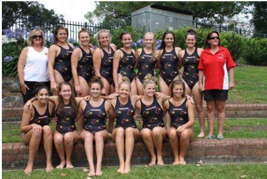
DRUMMOYNE U18 2011 NSW CLUB CHAMPIONSHIP TEAM