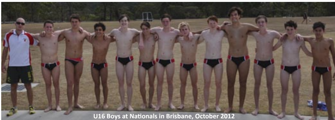
U16 Boys at Nationals in Brisbane, October 2012