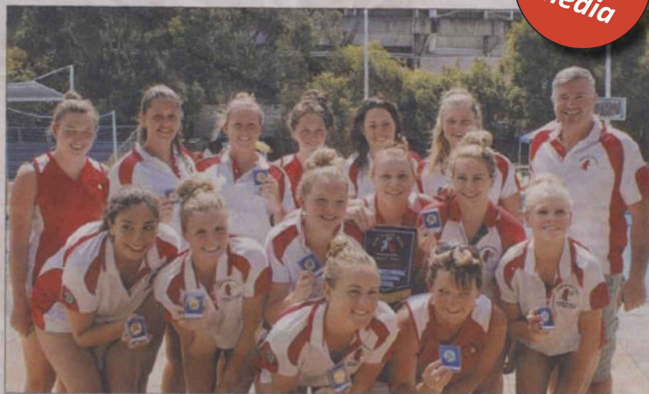
The successful under 20s women's Drummoyne team after the recent state championships in Parramatta.