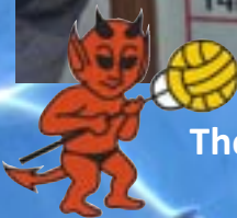
The post-Sydney Metro Comp tally for Summer 2012/13 DWPC clubroom door, May 2013