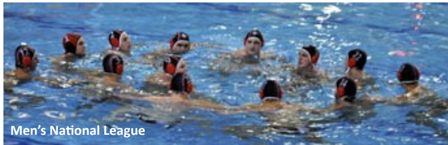
Men's National League