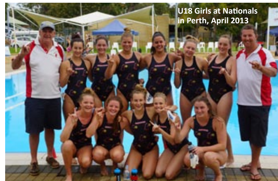
U18 Girls at Nationals in Perth, April 2013