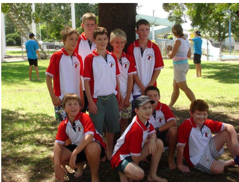
2010 U14B FUTURE DEVILS – YOU CAN SEE IT IN THEIR EYES!

The season commenced on a high with our biggest victory (by goals) achieved in our first game. The boys appeared to have learned from their Winter Comp intro to water polo & the benefits were on display. The Coach's optimism was slightly dimmed when the following weeks we lost by similar margins as it became apparent that there was a large chasm between A & B teams. We were competitive against all other B teams who were mainly the same age but not against the A teams who all had mostly boys in their second Summer of U/14s.