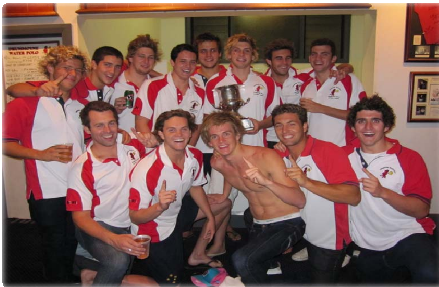
2009 MENS 1 ST GRADE PREMIERS