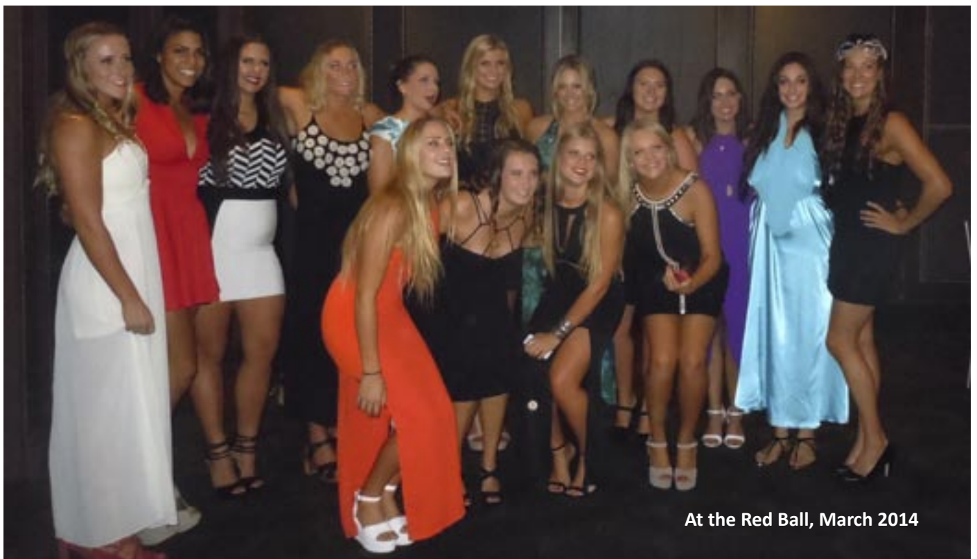
At the Red Ball, March 2014