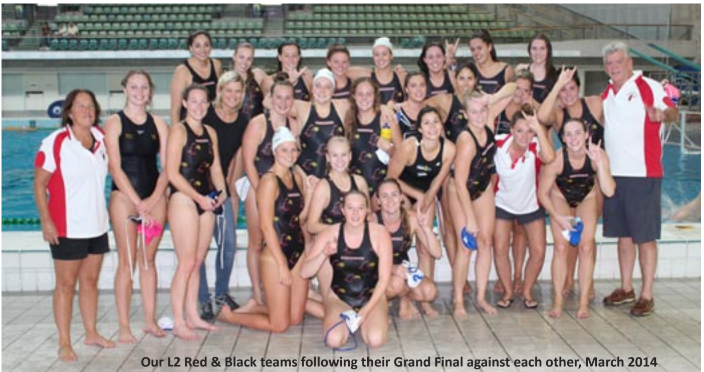
Our L2 Red & Black teams following their Grand Final against each other, March 2014