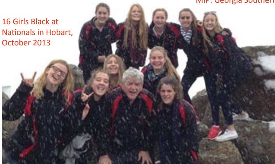
16 Girls Black at Nationals in Hobart, October 2013