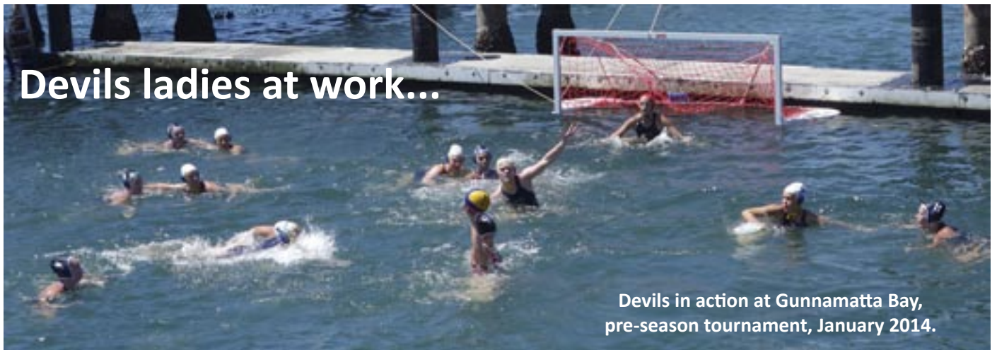
Devils in action at Gunnamatta Bay, pre-season tournament, January 2014.