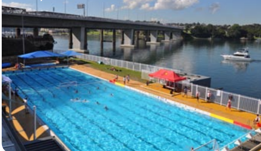
Drummoyne Pool, home of the Drummoyne Devils

Supporting long standing sporting values of participation, competition and community, the Club continues to innovate and lead the progression of water polo in this country.