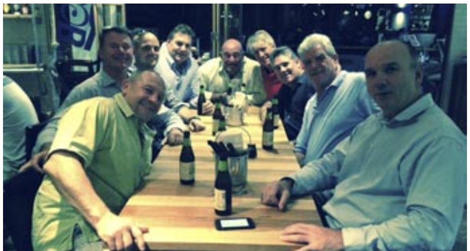
Some of our M6 enjoying a post season debrief.